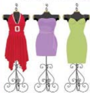
Image is about more than just colour... and does not have to cost the earth

Style advice, wardrobe consultations and personal shopping services